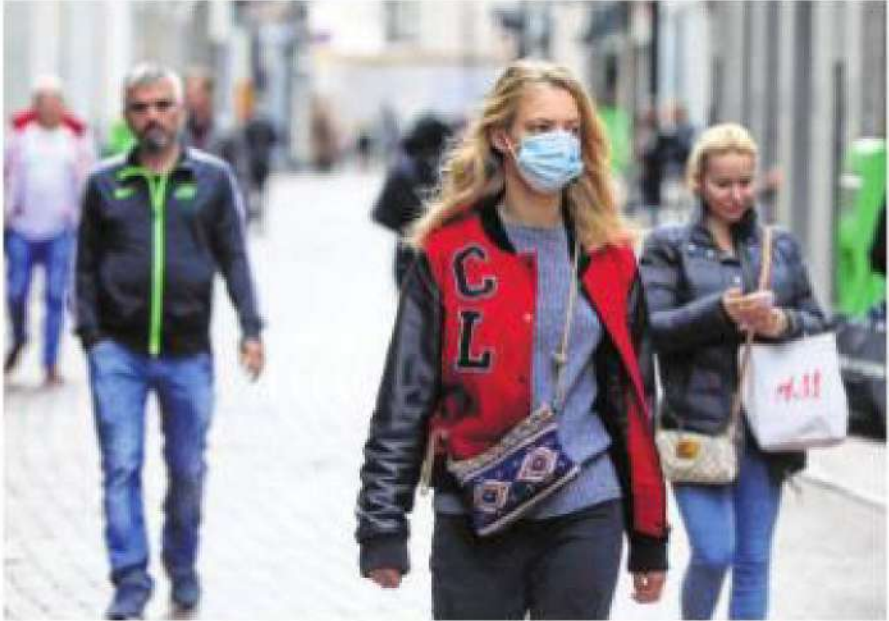
Dutch consider new partial lockdown as Covid cases hit record.

Dutch broadcaster NOS, citing unnamed government sources, reported that the government is planning to impose three weeks of measures including closing bars, restaurants and non-essential stores at 7 pm and banning fans from sports events. That could mean the Dutch national team playing a World Cup qualifier against Norway on Tuesday night behind closed doors. The government has not formally commented on the reports. New measures are set to be unveiled by caretaker Prime Minister Mark